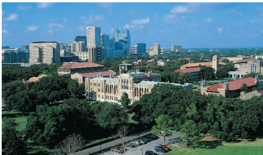
Marriage proposal. Rice (foreground) has offered to tie the knot with nearby Baylor College of Medicine.

SOURCES: RICE THRESHOLD; RICE UNIVERSITY